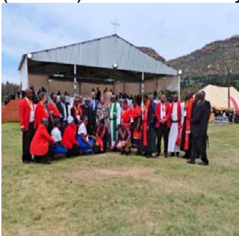
Our Group with the King and Queen of Lesotho

We got home safe and well at the end of October from a trip to Morija Mission in Lesotho. It is a non-stop bus ride of over 30 hours each way from Livingstone. Western Presbytery were invited to participate in a Church event being held by the Lesotho Evangelical Church in Southern Africa (LECSA). Lesotho is 200 years old, and the Church is 191 years old this year.