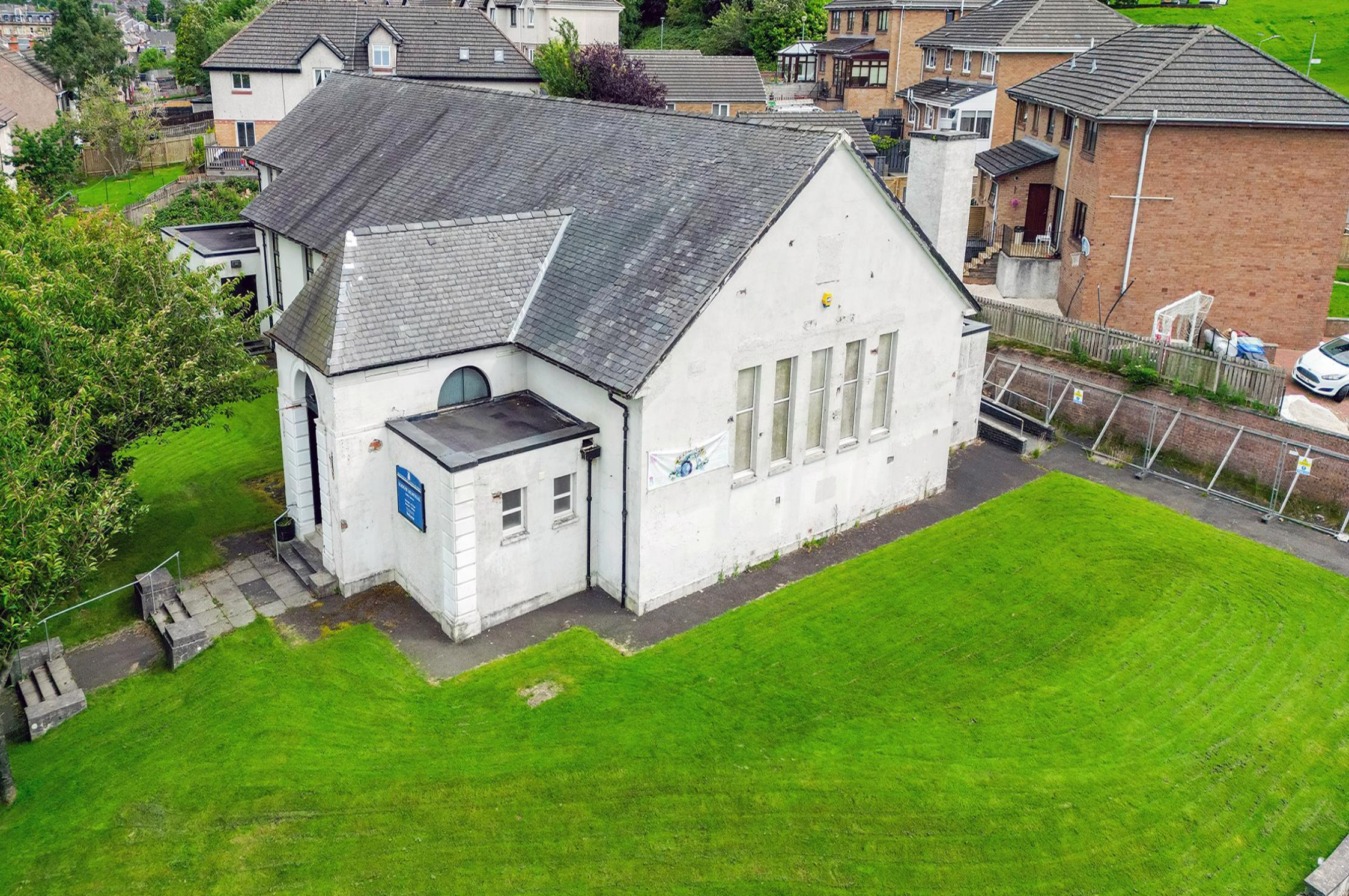
Blairbeth Church & Hall, 1 Kirkriggs Avenue, Rutherglen, G73 4LX