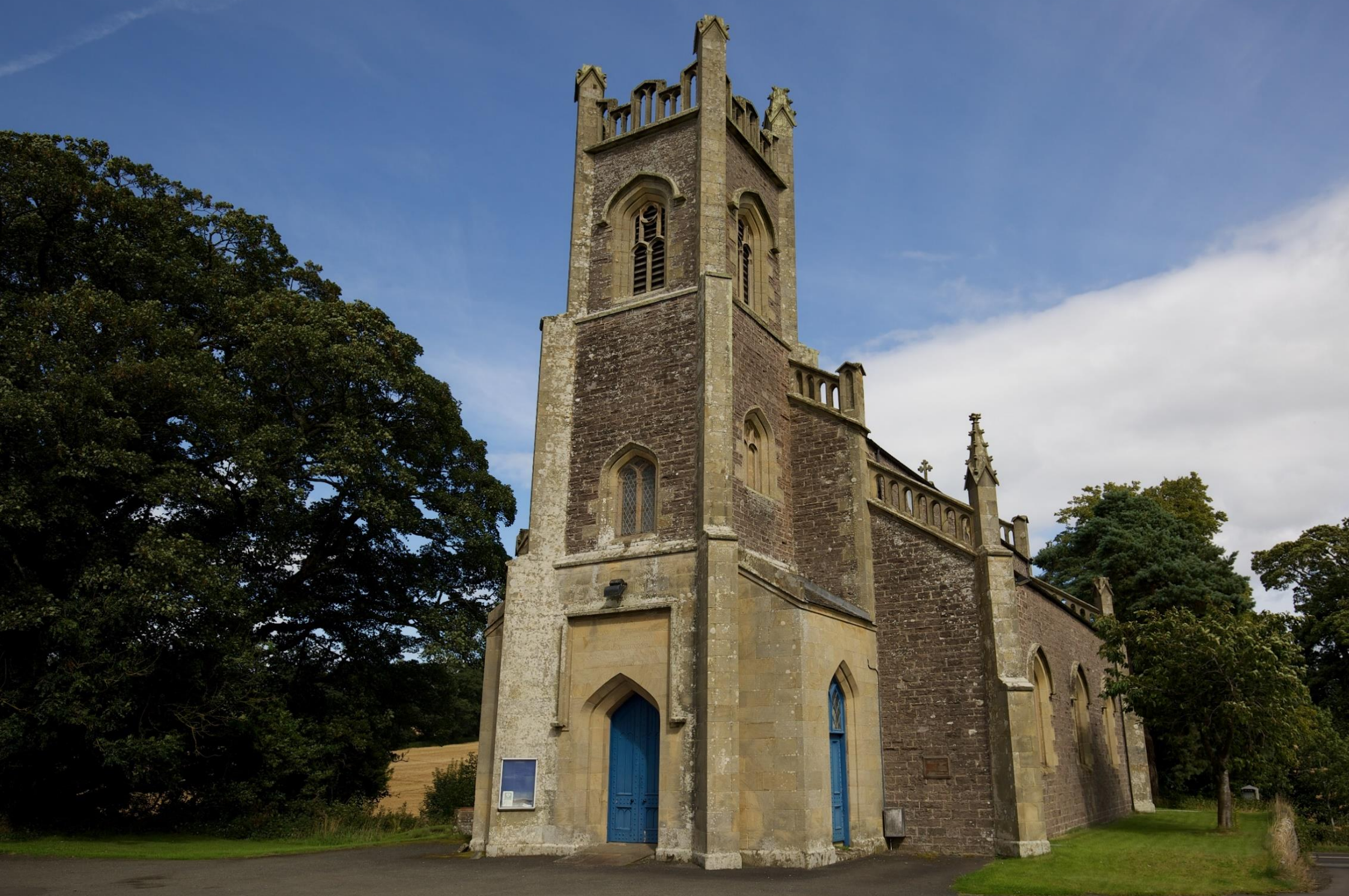
Kincardine- in- Menteith Church, Blairdrummond, Stirling, FK9 4UX