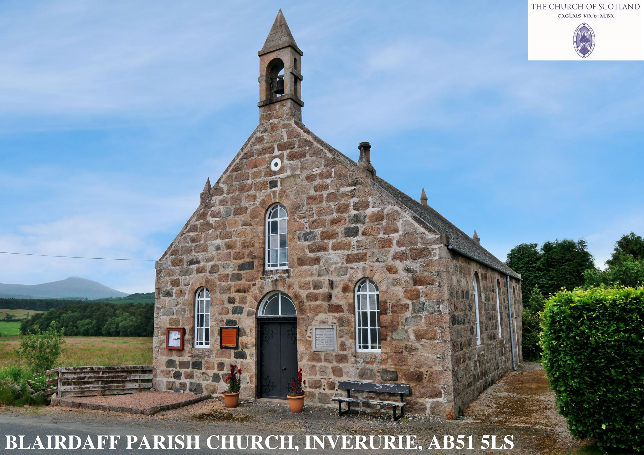
BLAIRDAFF PARISH CHURCH, INVERURIE, AB51 5LS