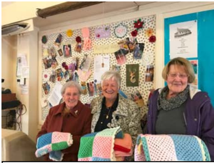
Knit and Natter Group. Donating baby clothes and blankets

We next started to work in Fife with the Sunday service at Dunfermline Abbey. Later in the week we were given the opportunity to speak to pupils at two schools in Fife. The children were engaged, knowledgeable and asked very good questions.