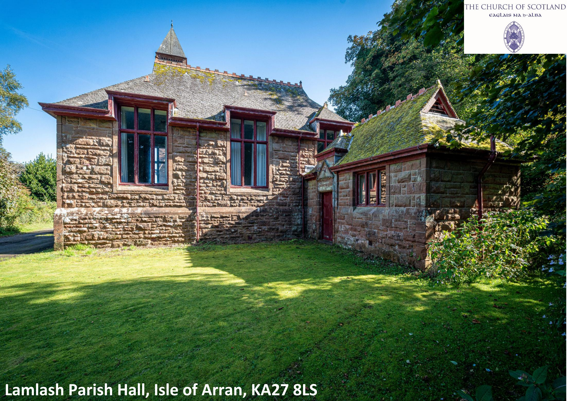
Lamlash Parish Hall, Isle of Arran, KA27 8LS