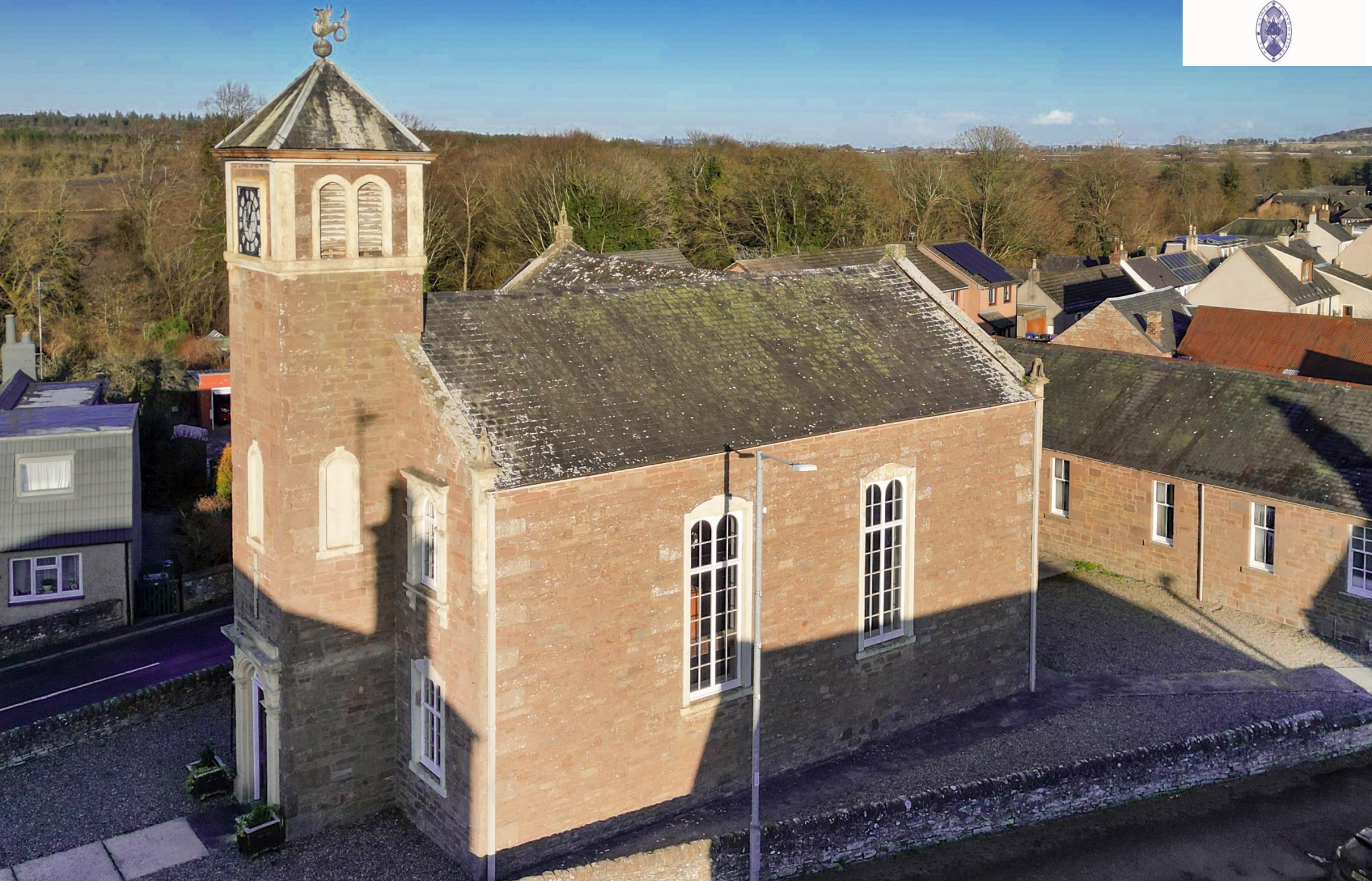
Friockheim Kinnell Parish Church and Hall, Gardyne Street, Friockheim, DD11 4SN