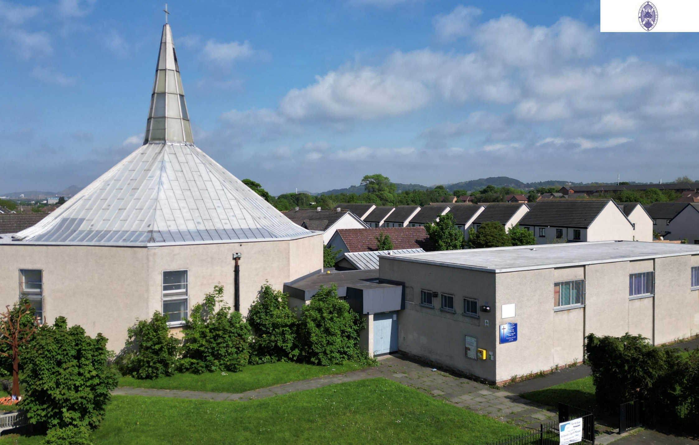
St Davids Broomhouse Church, Broomhouse Crescent, Edinburgh EH11 3RH