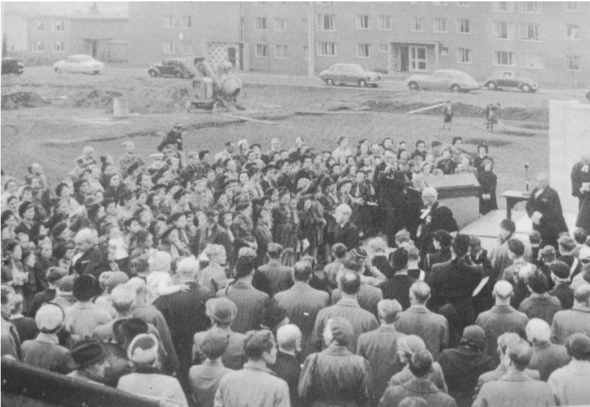
Procession after laying of the Foundation Stone 1955

In 1953 a competition for the design of a new church, was held by the National Church Extension Committee. 83 designs were submitted by architects from all over Scotland. The winning design was by Messrs Doak and Whitelaw, architects. They formed the partnership of Ross, Doak and Whitelaw. Work began on the new building in September 1955