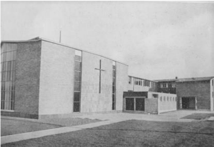
Completed church with grounds laid out circa 1958

Back in 1939, when the cost of the church was estimated to be £12,000, the Sunday School children of Scotland were asked to raised 4/5ths of the cost and the church would be called St Nicholas (the patron saint of children). In 1944 another, similar scheme was launched, again appealing to Sunday School children, with the slogan 'a penny per child per quarter'. Any Sunday School taking part would be entered on a permanent record in a Book of Contributors and you can view a copy of the book at the back of the church. Eventually, the children raised the total of £51,000. We owe a tremendous debt to the Sunday School children of Scotland and to the scheme's organisers. The remaining cost of the church (total £52,660) and the manse (£12,777) was met by the congregation who were asked to give sixpence in addition to their regular weekly offerings.