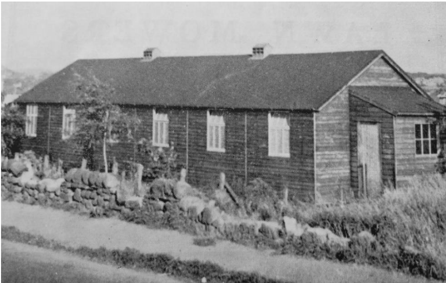
The hut on Calder Road circa 1939

2019 is a momentous year for St Nicholas Church, Sighthill (The Children's Church). This year marks the 80 th anniversary of the founding of our church. 80 years ago, in 1939, life at St Nicholas Church did not begin in the grand building you are visiting today but in a small wooden hut behind a drystone dyke, beside the quiet country road that was Calder Road.